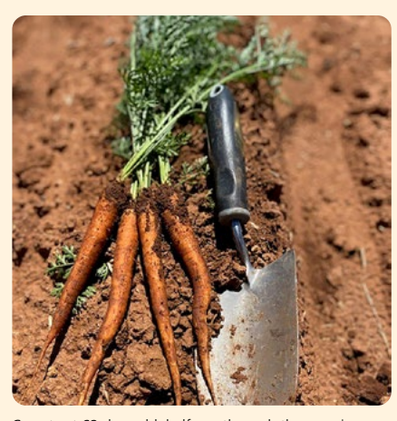
Carrots at 62 days old, halfway through the growing cycle at the on-farm trial.

As a soil ameliorant, Trigger is highly compatible with other fertilisers, easy to use in a custom blend and seamlessly integrating into a diverse nutrient management program that optimises crop performance.