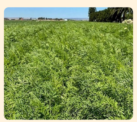
Crop at 93 days old, three weeks before the carrots are harvested.