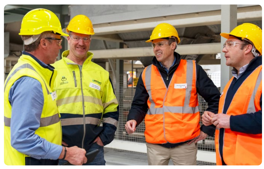
Incitec Pivot staff and customers at our Portland PDC Open Day in 2024

Incitec Pivot Fertilisers (IPF) achieved a significant milestone in November 2024, winning the Established Business-to-Business category in The Australian Financial Review's Customer Champions awards.