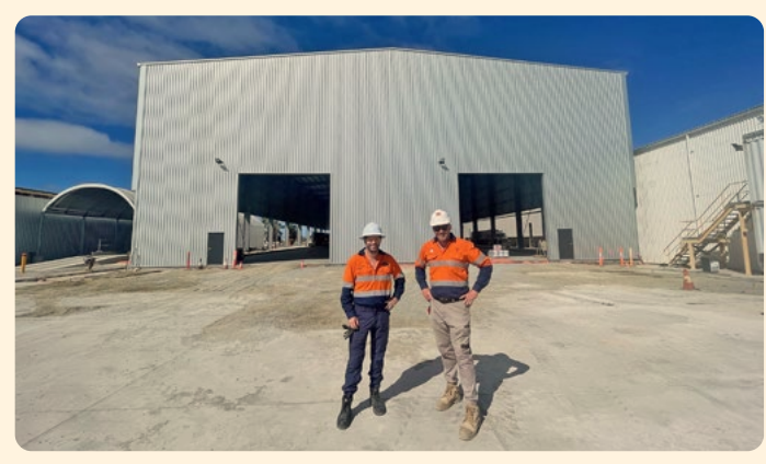
The new storage shed at the Port Lincoln Primary Distribution Centre (PDC) under construction.

Over the past 10 years, IPF has invested $14.5 million in the Port Lincoln PDC, which has more than